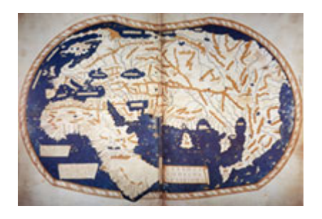
Description: World map, c1489, of Henricus Martellus. A similar map is believed to have influenced Columbus's ideas about his first voyage.