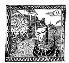
Description: Woodcut from 1493 of Native Americans fleeing in fear of Columbus as he sets foot on the Bahama island "Guanahani."