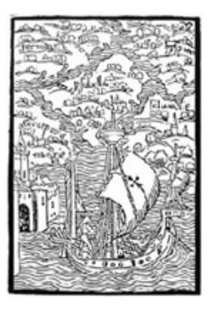
Description: A 1493 woodcut accompanying Columbus's "Letter on the First Voyage," illustrating his arrival in the Indies.