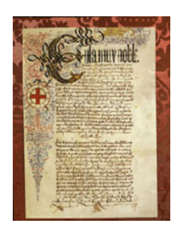
Description: The first page of Columbus's 1492 manuscript The Book of Privileges.