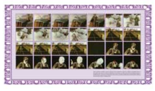
Click here for a larger image