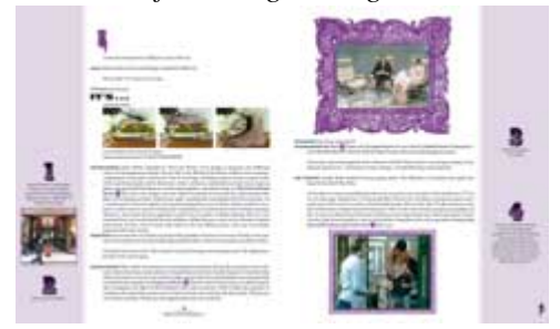
Click here for a larger image