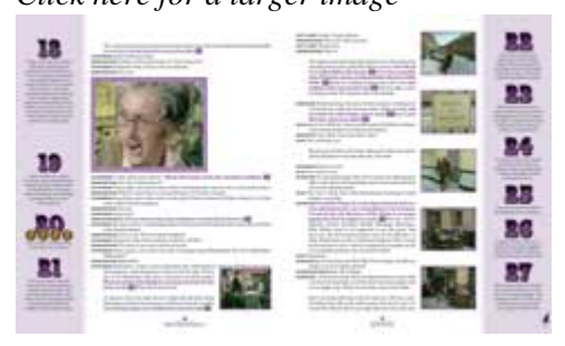
Click here for a larger image